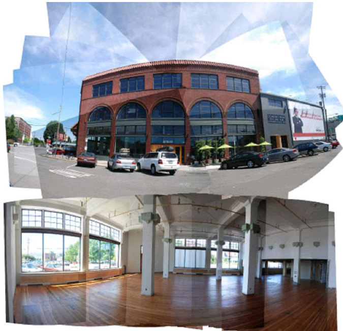
TRADING SPACES: The Leftbank Project's entrance on North Wheeler Avenue (top); the Leftbank space that once housed jazz club the Dude Ranch (bottom).